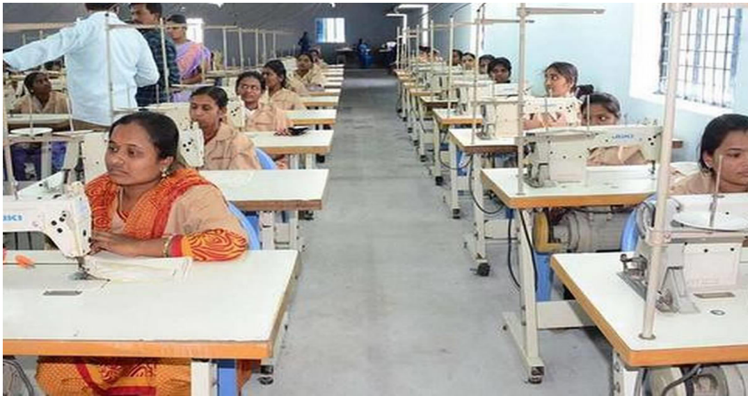
MSME providing entrepreneurship opportunities in India

MSME has established a Women Entrepreneurs Cell (WEC). It is hoped that the WEC would work to catalyze the growth of the women entrepreneurs in the country, in the years to come. It is time for women to think beyond the stereotype set for them and grab the opportunities that come their way, and lead the next generation of young women towards equitable and balanced growth of the nation. Women form one half of the population, and sustained growth and development is impossible when a half of the population lags behind. The Government celebrates the indomitable courage of thousands of daughters of the nation, who have played a great role in shaping the growth story of this great nation!! This issue presents a few inspiring stories of successful women entrepreneurs who have availed benefits through the schemes of this Ministry, and who have become self-reliant and are inspiring models for the women of younger generation in their communities.[1]