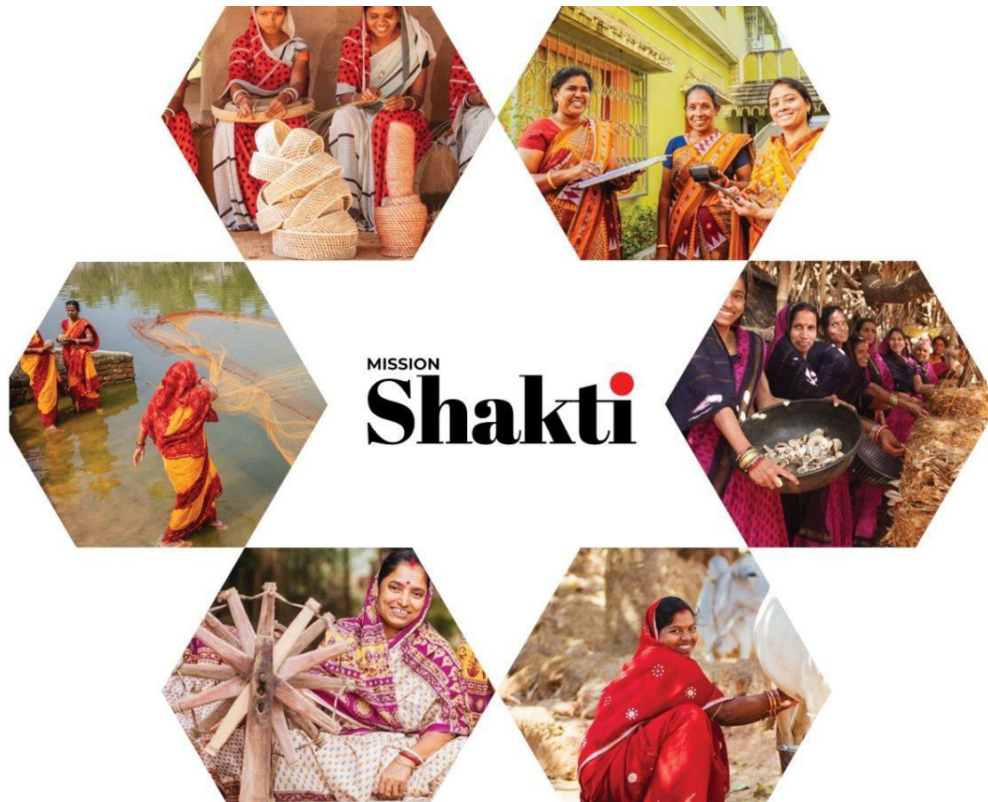
MSME promotes mission shakti for mahila udyog

It can be said that today we are in a better position wherein women participation in the field of entrepreneurship is increasing at a considerable rate.[10]