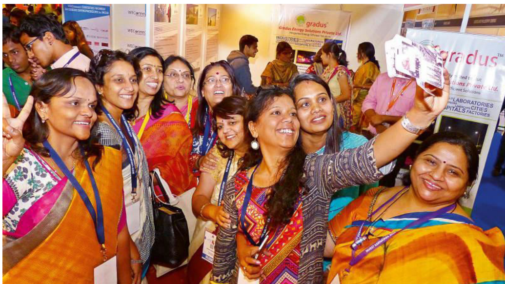
Women awarded as entrepreneurs

This scheme of Punjab National Bank provides financial assistance to women who intend to establish a small and micro-enterprise in the non- farm sector.[6]